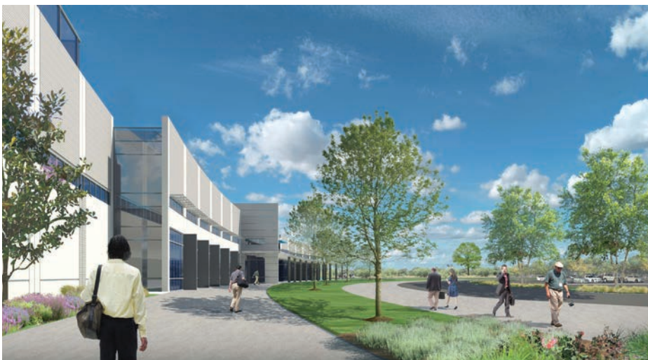
Daiken Goodman Air Conditioning will consolidate into a new campus west of the Grand Parkway. The move will vacate space around the northwest Houston submarket.

Growth in the industrial segment in Texas continues unabated as the business-friendly climate, job growth and surging population numbers keep the economy going strong. All four of the state's big markets — Dallas, Houston, Austin and San Antonio — are contributing to the industrial sector's increasing construction and occupancy.