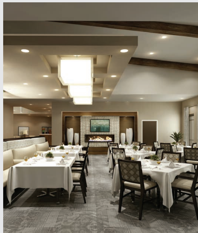
Avanti at Vision Park will include amenities such as an art studio (at left) and formal dining room (at right) in its location in suburban Houston. According to NIC, there are currently 1,863 seniors housing units under construction in the Houston area.

to a big hospital system and negotiate to become part of their network. A smaller operator doesn’t have the ability to negotiate with a big hospital system.”