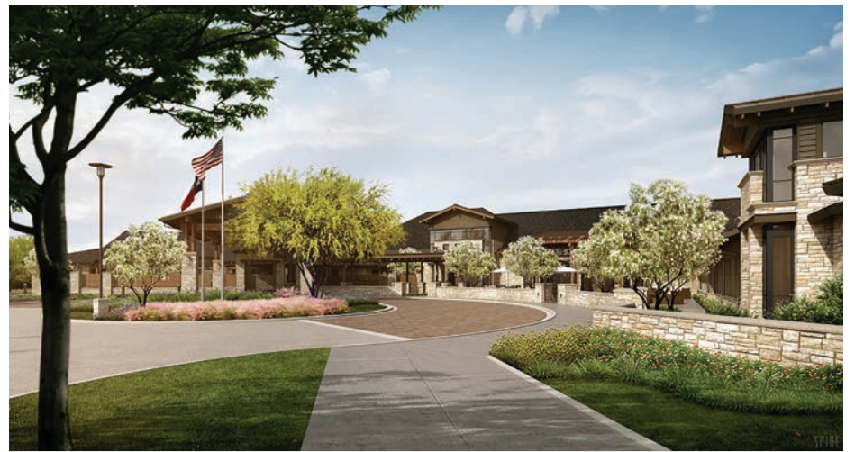
Developer and operator Avanti Senior Living is constructing the $17 million, 77,000-square-foot Avanti at Vision Park in Shenandoah, a suburb of Houston.